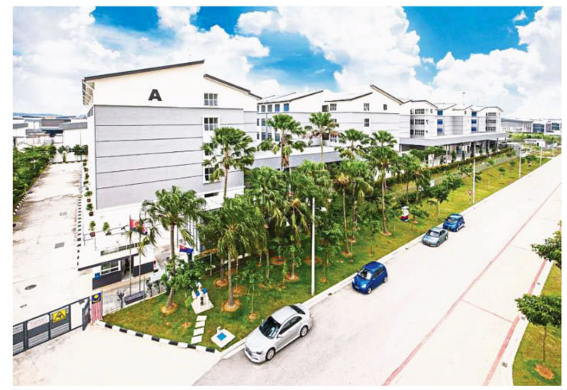
The workers' hostel located in i-Park@Indahpura is the first of its kind in Johor. It can accommodate 3,1000 workers and comes equipped with facilities including wireless Internet and a television hall.