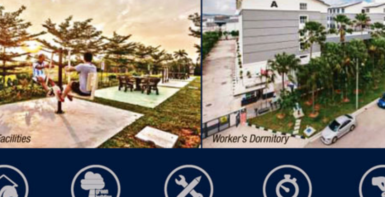
Option to Rent / Outright Purchase