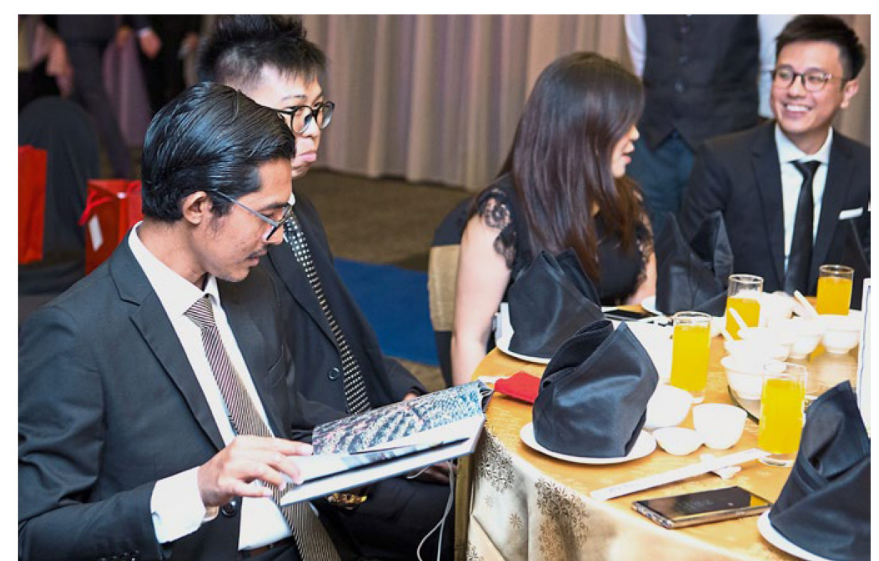
An attendee checking out the 'Johor Most Exceptional Developments 2018/2019' coffee-table book.