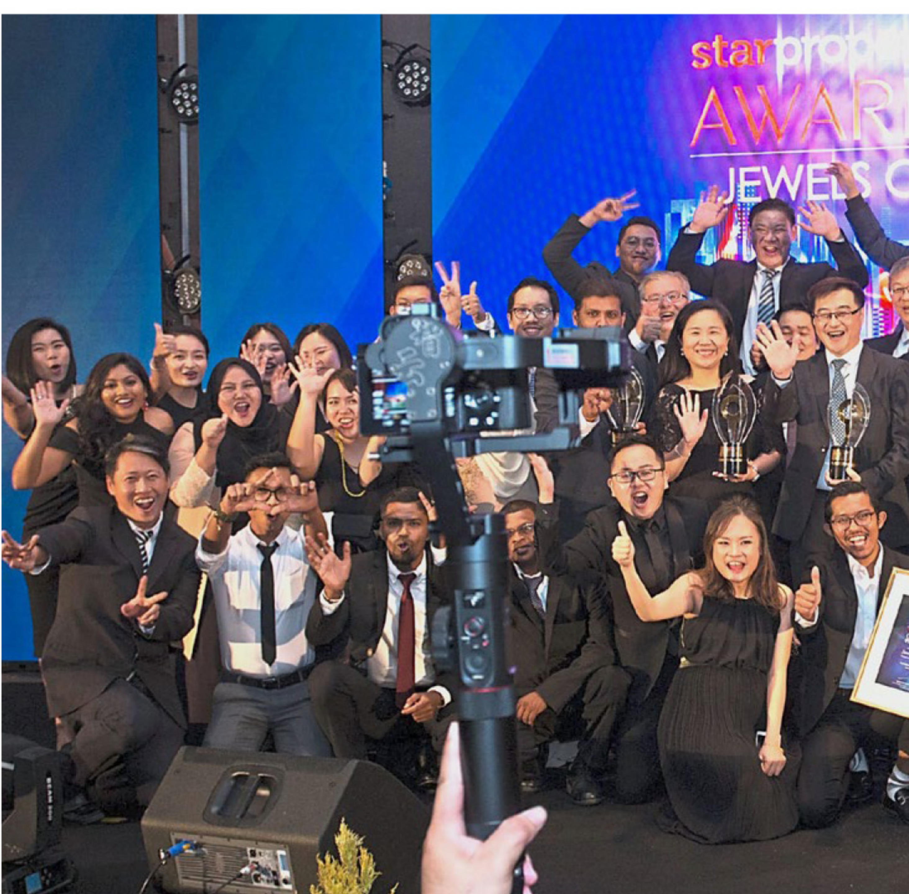
The biggest winner of the night, Sunway group, celebrating with their four awards.