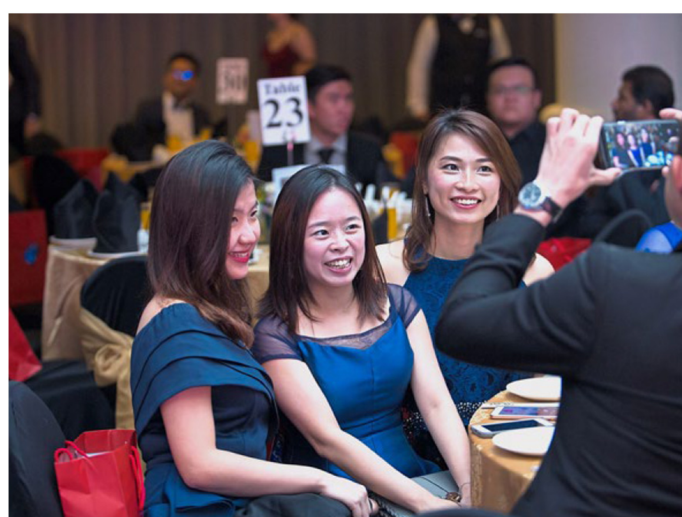
Shades of blue: Ladies from AME Development Sdn Bhd taking the opportunity to commemorate the event with photos.