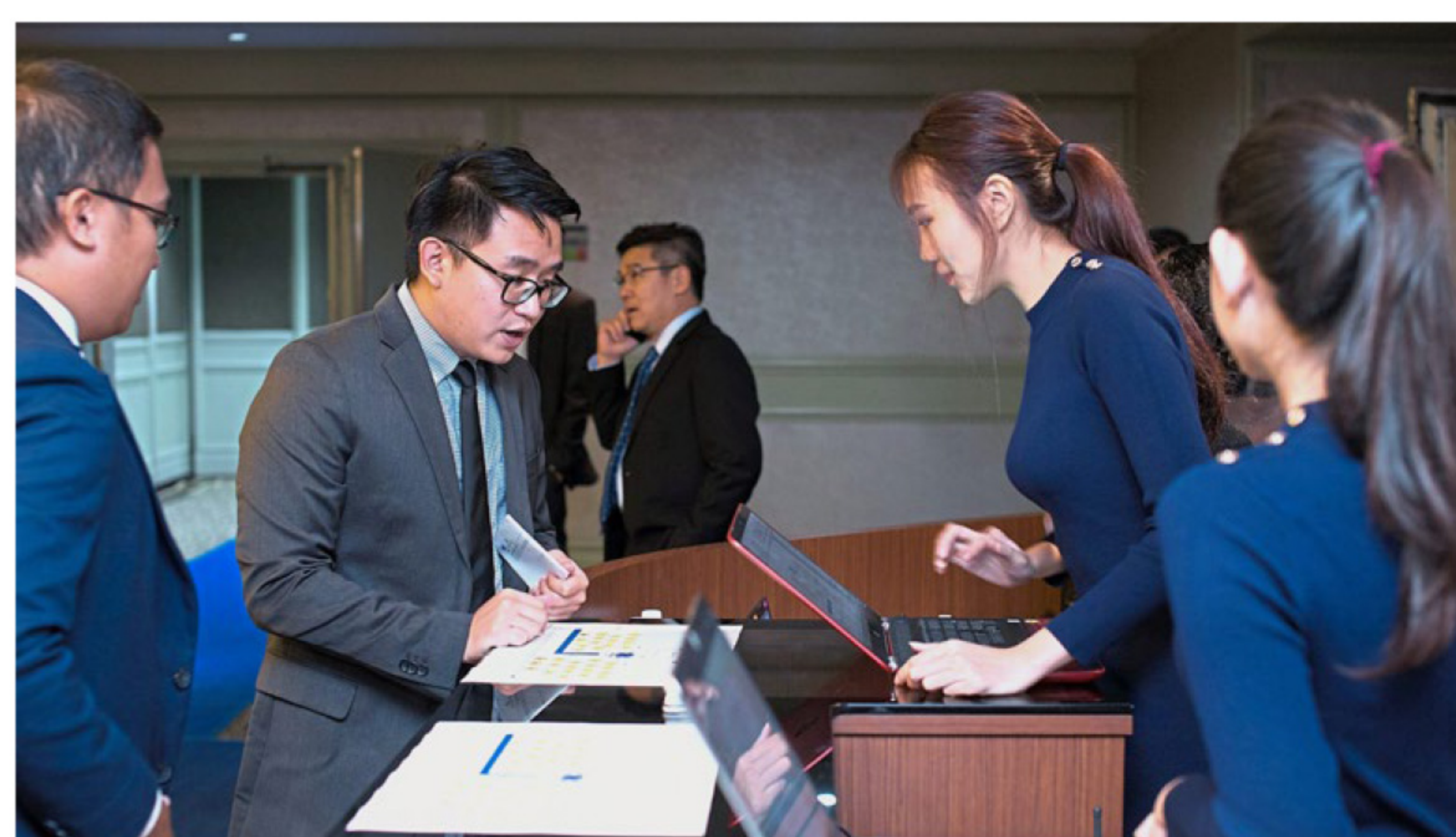
Guests and participants at the pre-event registration counter.